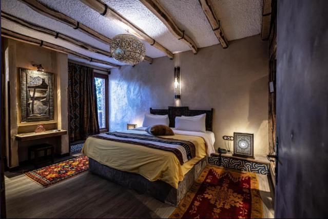
Hotel Xaluca Dades ★★★★★