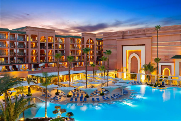
Savoy Le Grand Hotel Marrakech ★★★★★