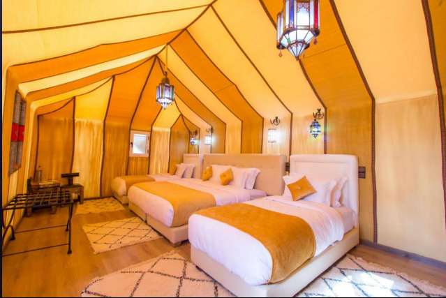
Sahara Sky Luxury Camp ★★★★★